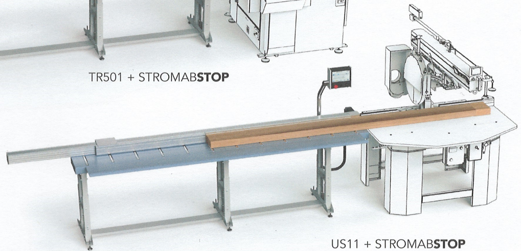
US11 + STROMABSTOP