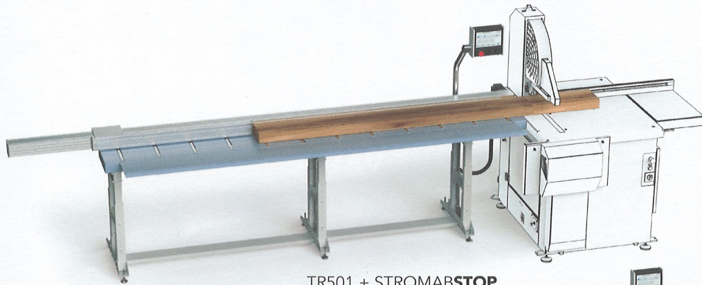
TR501 + STROMABSTOP